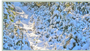
The trails at Baker Hill are popular for snowshoeing.

The trail network on this 58-acre also welcomes runners competing in FBC's annual Autumn Trail Race each November. Connects to Long Ledges Preserve and Schoodic Bog via Schoodic Connector Trail.