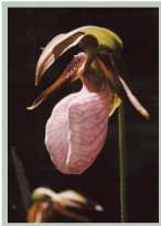
Lady's Slipper Orchids emerge along the trail in spring.

The southernmost trail summits Baker Hill and hosts the Downeast Phenology Trail, a volunteer citizen science project tracking the impact of climate change on plants.