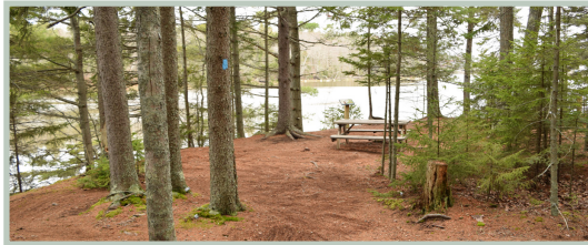
A picnic table at the end of the trail to Indian Point on the Union River.

A wooded trail near downtown Ellsworth leads to a scenic viewpoint along the Union River.