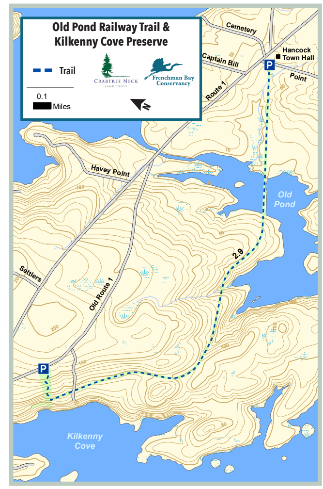
Frenchman Bay Region • 15