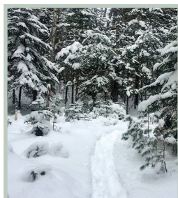
The Simon Trail parking lot is often plowed after snow, making it a great place to snowshoe (Iris Simon).

Follow a flat loop trail in the heart of Lamoine, where several seasonal streams support a variety of mosses, ferns, mushrooms, and wildlife.