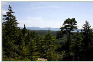
A view from the summit.

A forested trail on a 121-acre easement that climbs to the summit of Tucker Mountain.